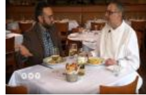
Three Roman Courses at Trattoria Diane ▶ VIDEO