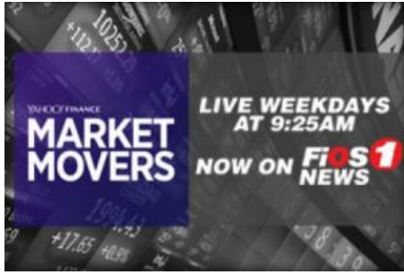
Yahoo Finance Market Movers ▶ VIDEO