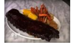
Slow-Smoked BBQ Ribs At Storyville American Table ▶ VIDEO