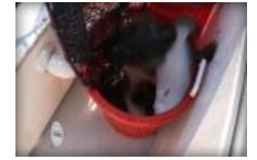
Gone Fishing at Point Lookout Clam Bar ▶ VIDEO