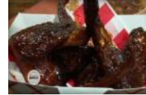
Chefs Become Pitmasters At Smoke Shack Blues ▶ VIDEO