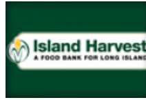
FiOS1 News Teams Up with Island Harvest ▶ VIDEO