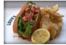
Legendary Views, Updated Food at Louie's Grill & Liquors ▶ VIDEO